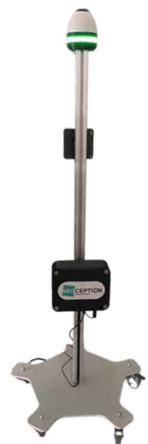
Neoception® eKanban Lite Pole

The workflow is lean and straightforward: scan the empty load carrier with at the RFID reader, and you're done!